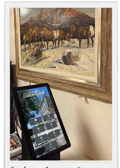
Carbon County Museum

MetroClick's technology allows for real-time updates, ensuring that the information displayed on the devices is always accurate and current. This includes live updates on events, weather conditions, trail availability, and local business hours, giving visitors up-to-date information during their stay.